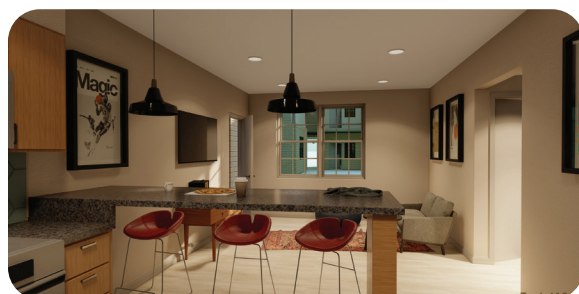
Rendering: Common Living & Kitchen

$300 Referral Incentive Available information on the back