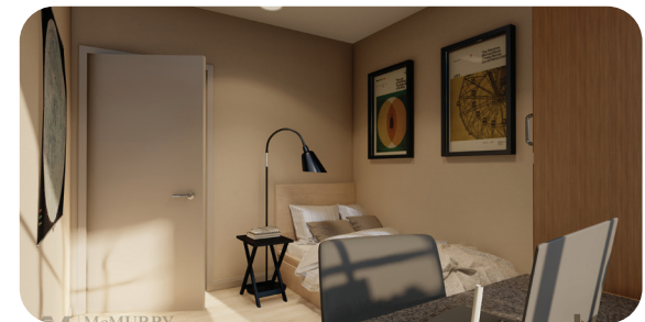
Rendering: Bathroom & Private Room